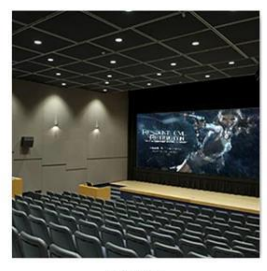
---- Cinema ----