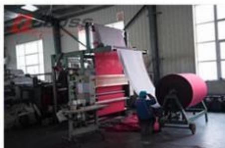
A2 Flame-retardant treatment