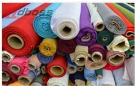
A1 Original Fabric