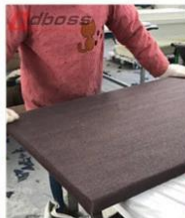
6 Wrap the fabric