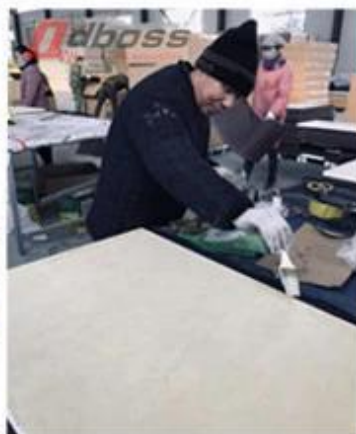
5 Apply the eco-friendly glue on the fiberglass panel