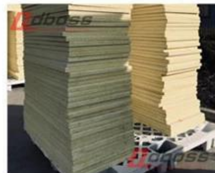
B3 Resin curing & Air drying