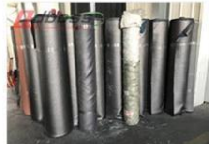
A3 Flame-retardant Fabric