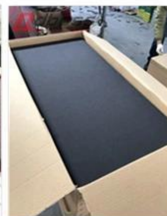
7 QC & Packing

For 24 hours contact Qdboss acoustic solutions details as below: