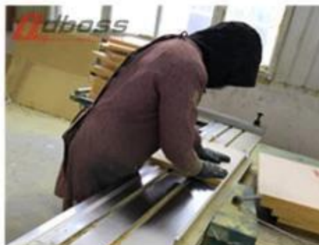
B2 Cutting different sizes/shapes