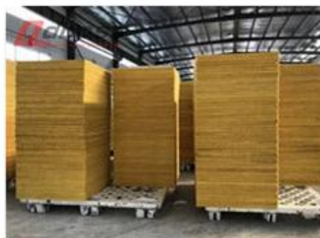
B1 Original fiberglass panel