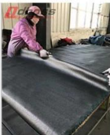
4 Fabric cutting