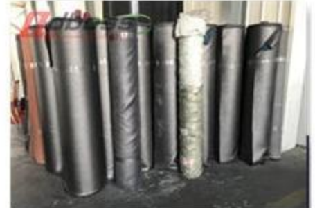
A3 Flame-retardant Fabric