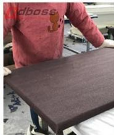
6 Wrap the fabric