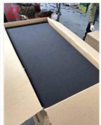
7 QC & Packing