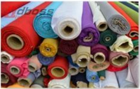
A1 Original Fabric

The fabric wrapped fiberglass panel can be put on the wall directly with air nail gun or glue.