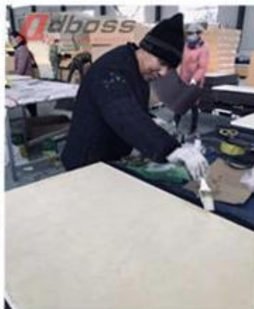
5 Apply the eco-friendly glue on the fiberglass panel