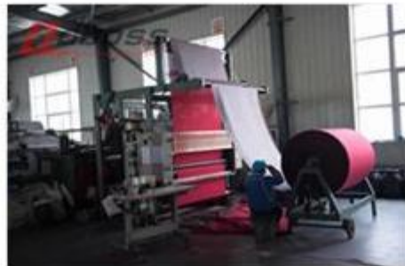
A2 Flame-retardant treatment