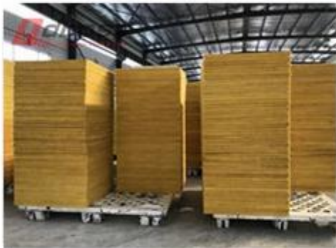
B1 Original fiberglass panel