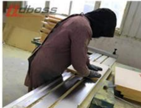
B2 Cutting different sizes/shapes