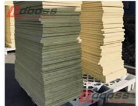
B3 Resin curing & Air drying