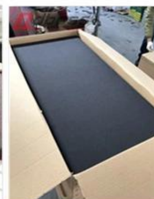
7 QC & Packing

For 24 hours contact Qdboss acoustic solutions details as below: