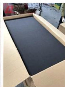
7 QC & Packing

For 24 hours contact Qdboss acoustic solutions details as below: