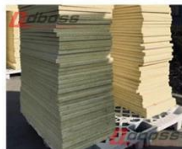
B3 Resin curing & Air drying