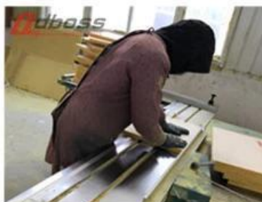
B2 Cutting different sizes/shapes