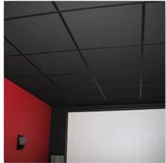
---- Studio Room ----