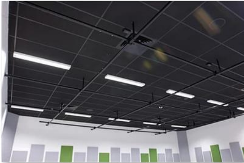
---- Office ----

QDBOSS Fiberglass ceiling tiles can be used in many public places where has strict request for acoustics, like Cinemas, Churches, Offices, Music Rooms, Auditoriums, Schools, Multi-purpose Rooms, and Theaters. We supplied large quantity of these false ceilings to many domestic and overseas projects and even built distributor relationships with some customers overseas.