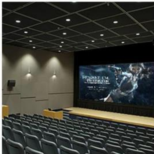
---- Cinema ----