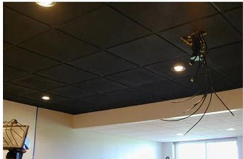
---- Home Theatre ----