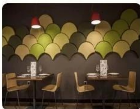
Restaurant & Hotel